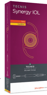
TECNIS Synergy™ IOL Toric II